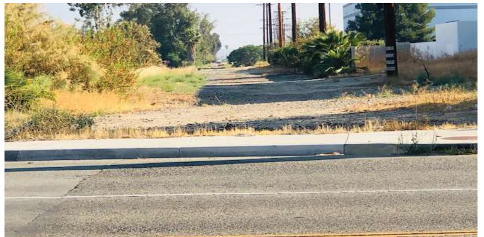
This is the south end of the RR property at Palmyrita Avenue.