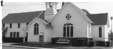
"This church has been serving the Highgrove community since 1890"