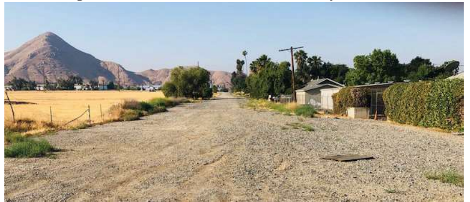
The above photo was taken from Center St. looking southward.

If a new North/South road was built on UP's abandoned railroad property between Center St. and Palmyrita Ave., extending Spring St. would not be needed because the Iowa Ave. overpass is also accessible from Palmyrita Avenue.