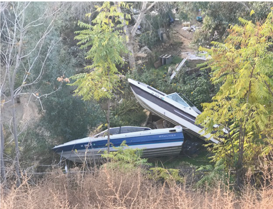
There are even two boats on this property but I wouldn't want to put them in the water before checking for holes in the bottom..