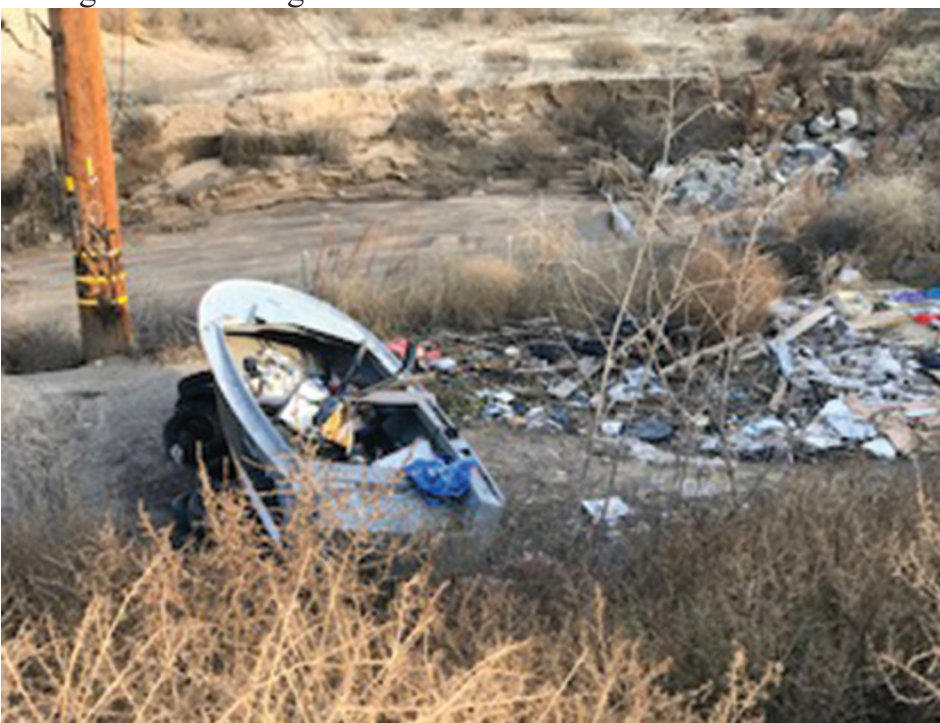
There is another boat and lots of trash on the east side of the track where the UPRR used to operate when they went over the arroyo..