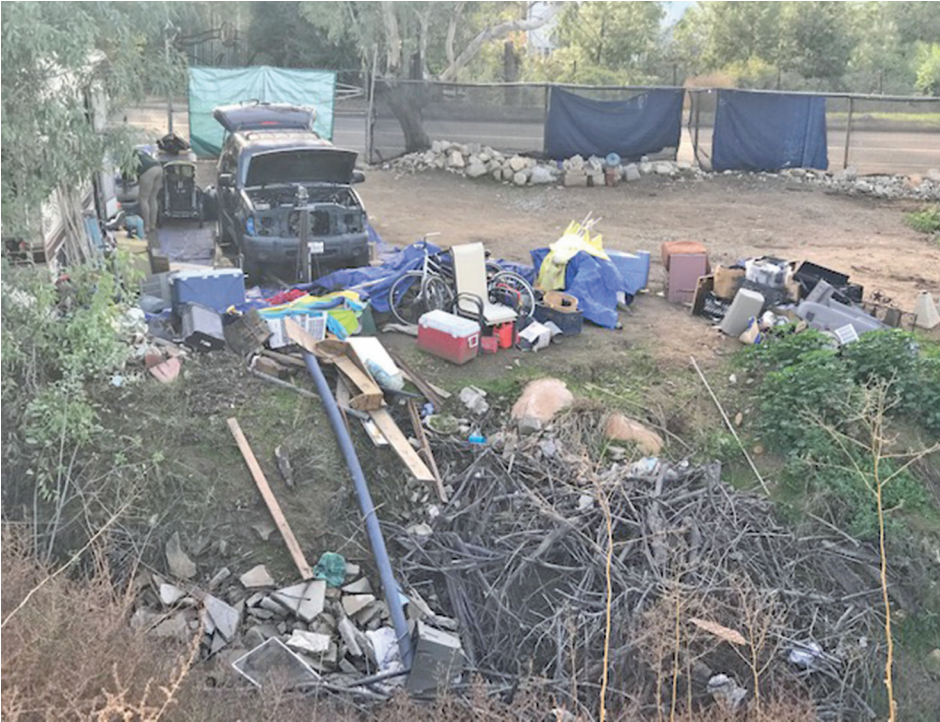
Behind the tarps on the fence is Prospect Avenue. There are people living among this junk and many cats who roam the entire area.