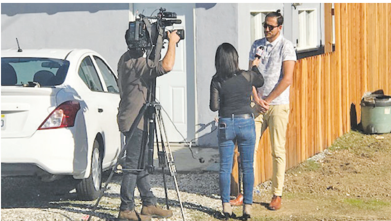
The property owner was interviewed by channel 11 because he is having trouble selling his house due to the trash next door.