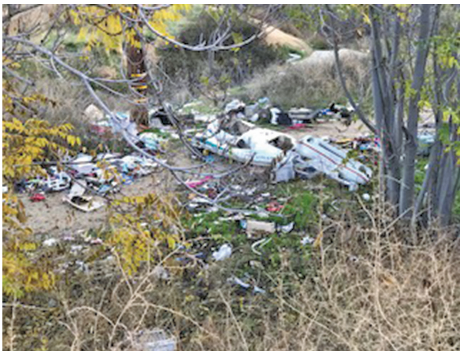
Also on the east side of the bank is more trash and even a jet ski. Maybe we should have a giant yard sale and everything is free!